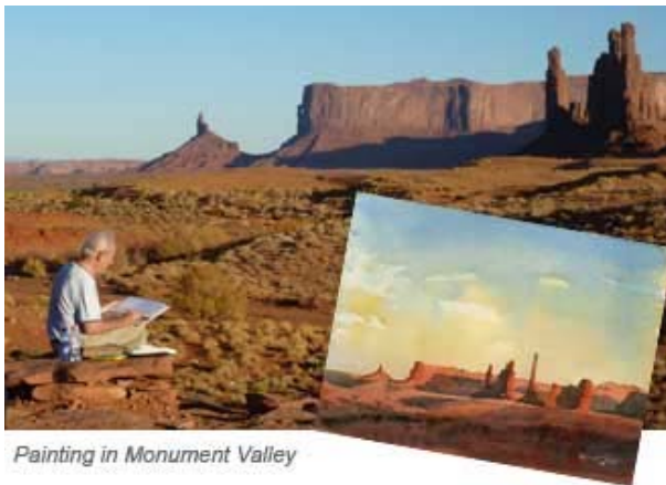
Painting in Monument Valley

We spent three weeks in Utah where I painted in the beautiful national parks. It was so wonderful to do that when we thought we would never travel again. See those paintings in the website (Artwork page).