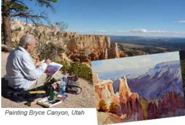
Painting Bryce Canyon, Utah