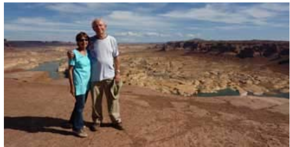
Life is great. Every day is a bonus.