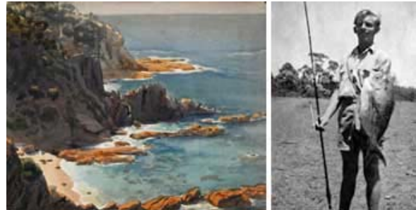
Malua Bay, Christmas 1947

While I'm in a philosophical mood, you might like to see one of my earliest paintings and me at that time, 1947.